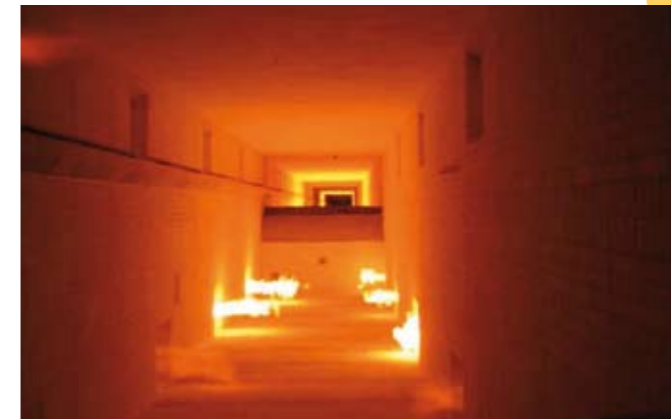
Low performance burner 1500 series