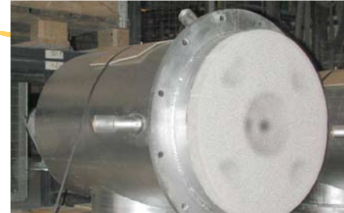
High performance burner 1500 series